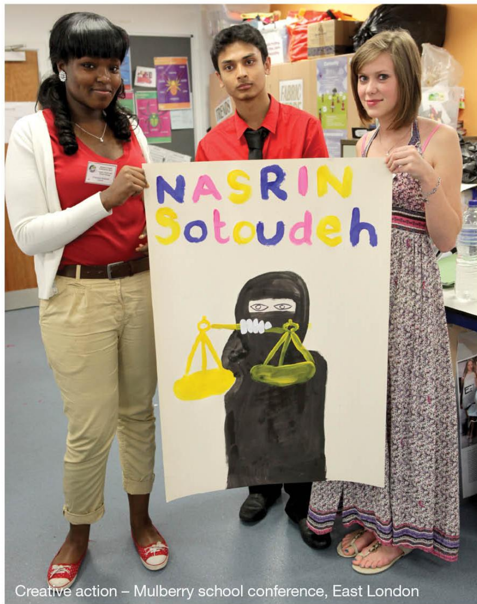
Creative action – Mulberry school conference, East London