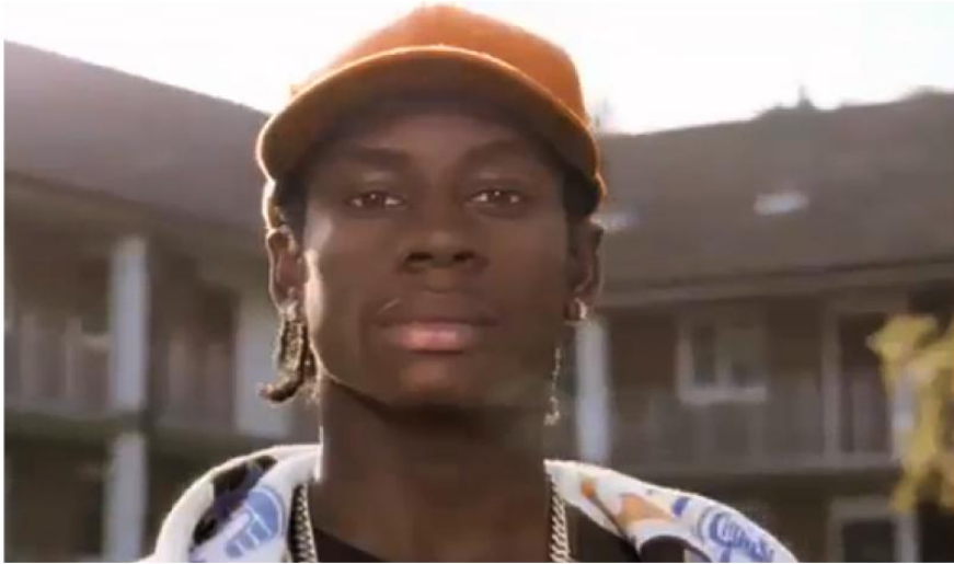
► YOU ARE POWERFUL